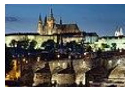
Prague and the Prague castle