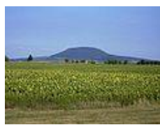
Říp Mountain, a legendary place