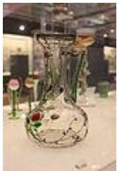
Bohemian glass and Bohemian crystal