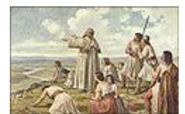
Forefather Čech the legendary founder of Czech nation