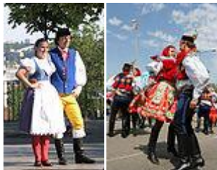
Kroj, national Czech costume