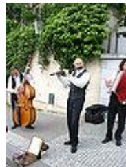
Polka, a dance style and a genre of dance music