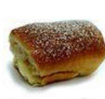
Buchta, popular Czech sweet pastry