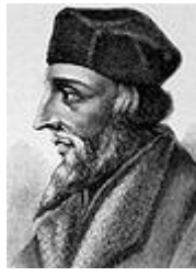
Jan Hus, religious reformist