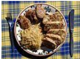
Vepřo knedlo zelo (pork roast with dumplings and sauerkraut)