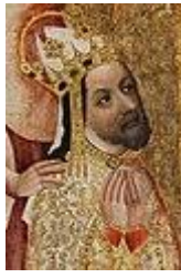
Charles IV, Holy Roman Emperor