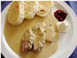
Svičková na smetaně national Czech dish