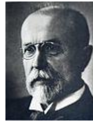
Tomáš Garrigue Masaryk