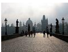
The Charles Bridge