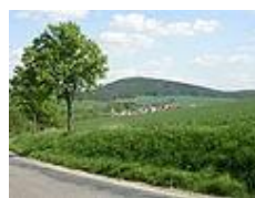
Blaník, a legendary mountain