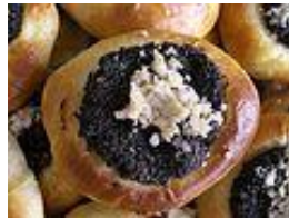
Koláč, famous Czech dessert