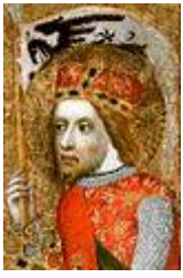
Wenceslaus I, Duke of Bohemia